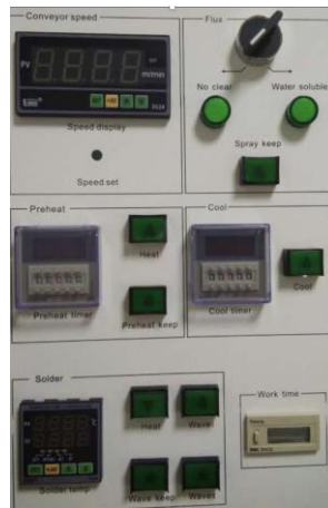
Control Unit (Panel)