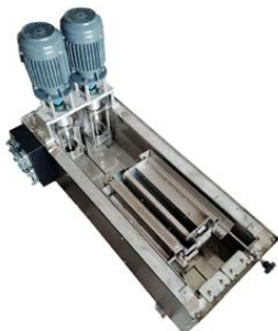
Modular solder pot (Option)