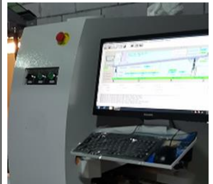
PC Control (Option)